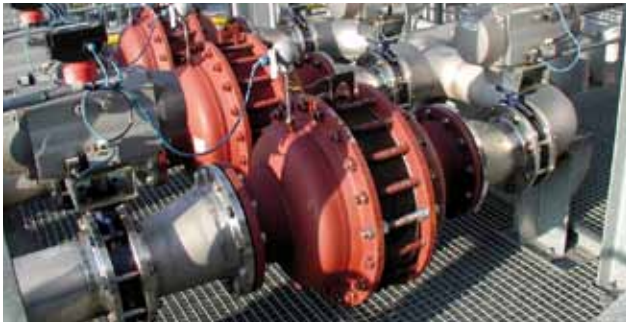
Ethylene Oxide Applications: PROTEGO® DA-SB-EO