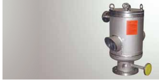
DMT Applications: Superheated Valves