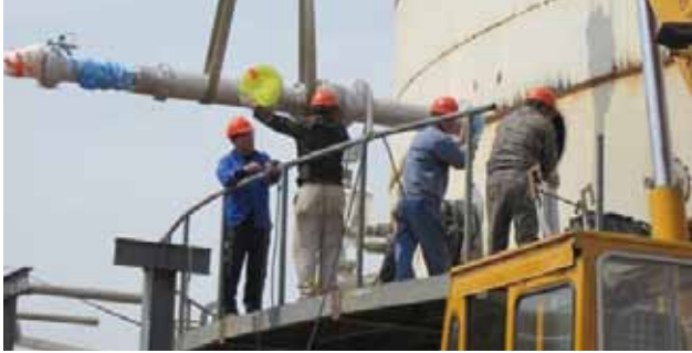
Internal Safety Valve PROTEGO® SI/DP