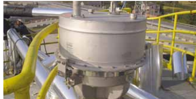
Acrylate Applications: PROTEGO® UB/SF

Our main objective is to have competent consulting services for technical issues with a broad range of requirement-based services for our products.